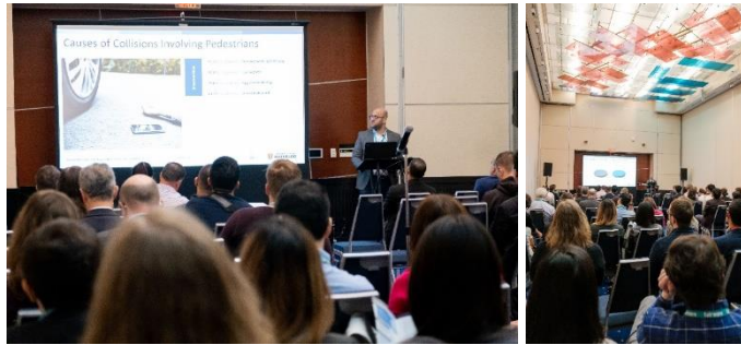
Figure 1 – Technical Presentation at CITE 2022

identify high-risk road segments. The goal of this research is to promote Vision Zero: to achieve no road user fatalities or serious injuries.