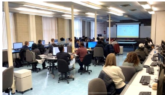
Figure 4 – ArcGIS Tutorial

On the training side, the student chapter organized an ArcGIS tutorial on February 10, 2023. Master of Environment student Jason Skidmore held a one-hour tutorial on ArcGIS. This event was attended by 32 students across many faculties and was comprised of an introduction to the software, its applications in transportation engineering and an exercise for students to develop a model with ArcGIS Pro. Numerous ITE Waterloo Chapter leadership team members were present to assist Jason in helping students learn ArcGIS and successfully complete the exercise. This event resulted in success with students asking for further information about ArcGIS and sparked further interest from students for future events.