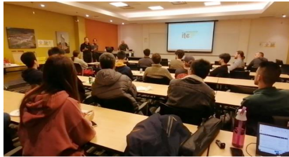
Figure 2 – Launch Event

A focus of the student chapter has been to attract more undergraduate students to be involved in ITE, which has previously attracted more graduate students and had a heavy research focus. Currently, there are 95 members on the mailing list, consisting of 25 undergraduate students, 50 graduate students, 7 alumni, 7 faculty members, and 6 non-faculty members. Out of the 95 members, 49 members were added in 2022.