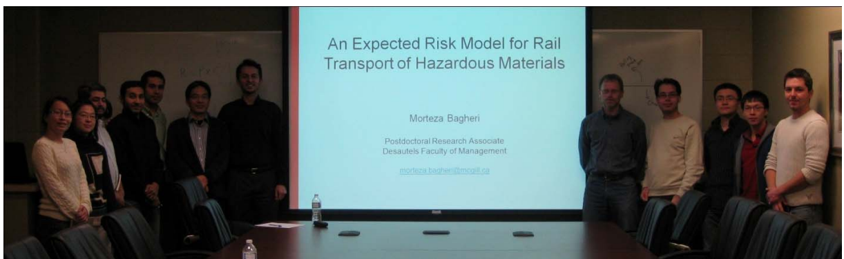
Figure 3: Group photo from Dr. Morteza's Seminar

Approximately Nine UW-ITE SC members turned out for Dr. Morteza's seminar on modelling rail derailment risk, illustrated in Figure 3.