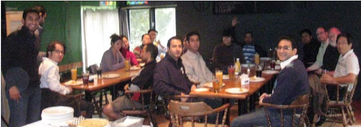
Figure 12 Social Gathering of the UW ITE SC in October, 2010

in 2010 Canadian Society of Civil Engineering 8th International Transportation Specialty Conference in Winnipeg, Manitoba. Another social gathering was held at the Grad House on October 21, 2010 (Figure 12) to welcome new students at the start of the new academic year.