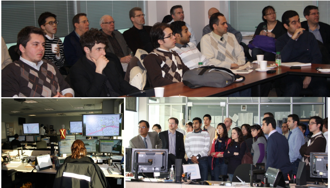
Figure 9: Toronto ITE Section YRT/Viva Transit operation center tour

Six members of the UW-ITE SC left Waterloo bright and early on February 11th, 2011 at 6:00 am to attend the Toronto ITE Section breakfast seminar and technical tour of the YRT/Viva Transit Operation Centre (Figure 9).