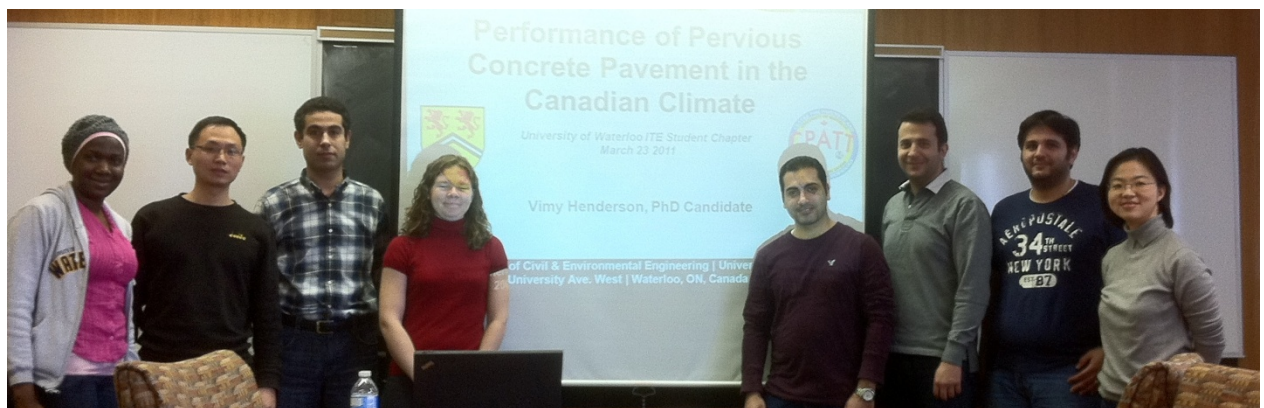
Figure 5: Group photo from Vimy's Seminar

For the last seminar of the Winter 2011 term about eight members attended (Figure 5). Vimy presented her research on pervious concrete pavements, specifically their applicability for the Canadian winter climate.