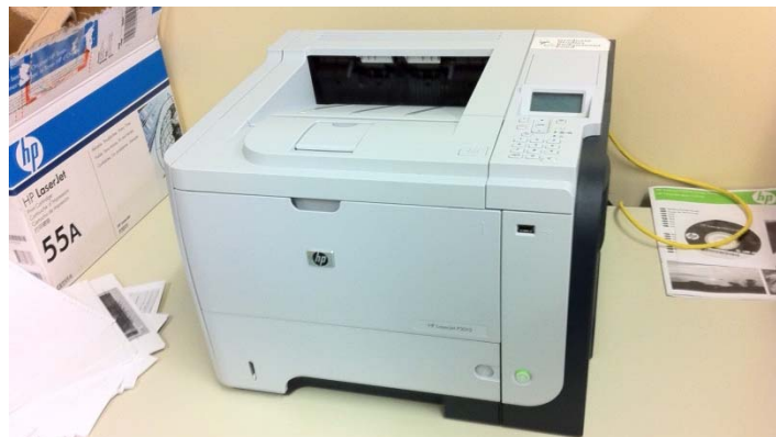
Figure 14 New HP Black and White Printer

The executives put together a proposal for funds from the Graduate Student Endowment Fund, which was created by the University of Waterloo and the Graduate Student Association to improve the lives of graduate students. This proposal was successful and the UW-ITE SC was awarded $750, which was used to buy the printer shown in Figure 14.