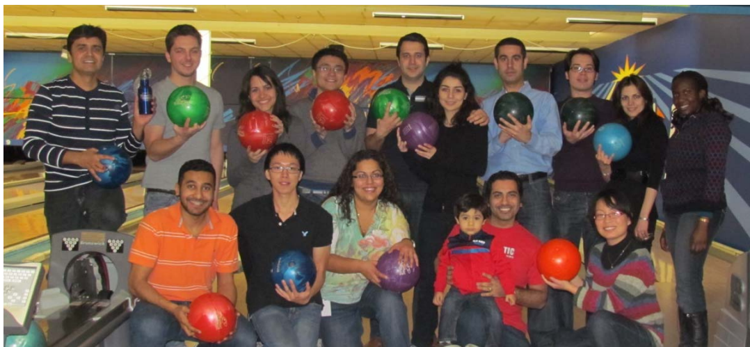
Figure 13 UW-ITE SC 10-Pin Bowling

On Friday, February 25, 2011 the UW-ITE SC held a 10-Pin Bowling Competition. Approximately 14 members turned up to enjoy 2 hours of bowling with soda and pizza provided through the UW-ITE SC funds (Figure 13).