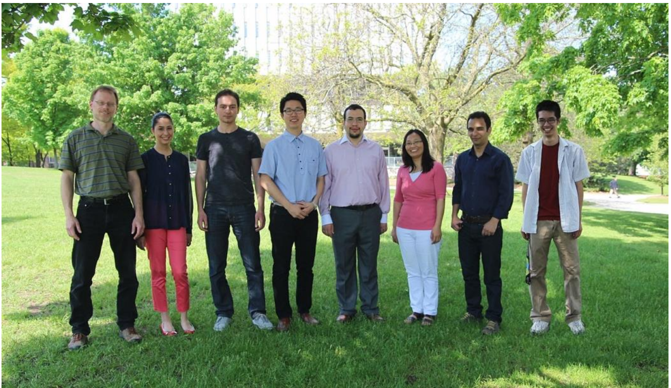
The 2013 – 2014 UW-ITE Executive