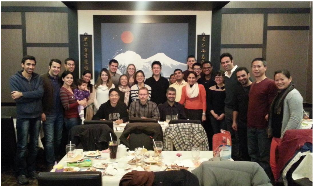
UW-ITE 2013 Christmas Luncheon