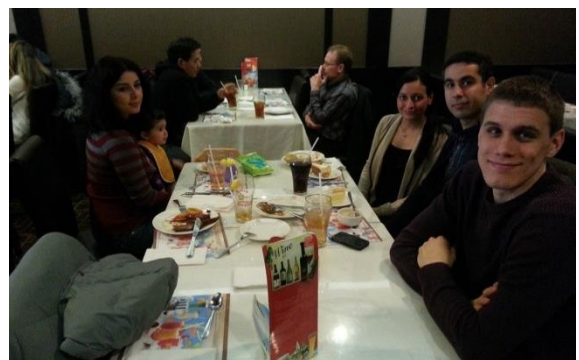
2013 Christmas Luncheon