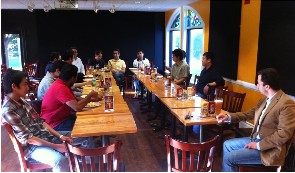
NEW TRANSPORTATION GRAD STUDENTS WELCOME EVENT

UW-ITE student chapter hosted two social events in fall 2013 term; ITE's New Transportation Grad Students Welcome event and 2013 Christmas Luncheon event.