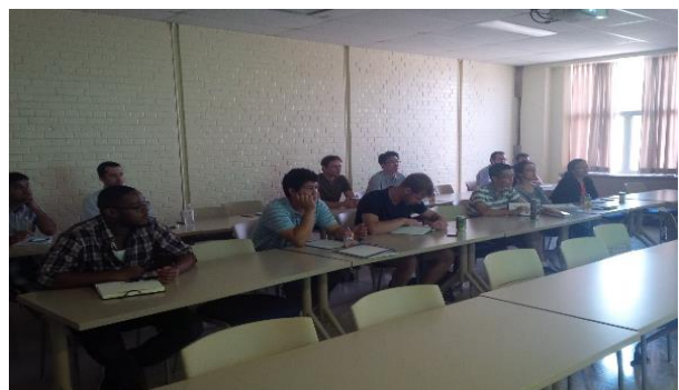
APTS Open Data Webinar