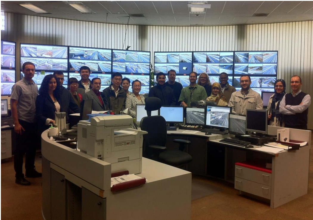
COMPASS OPERATION ROOM AT MTO

Fall term was a great academic season for the UW-ITE Student Chapter. During this term the student chapter hosted academic seminars, broadcasted webinars, and organized a field trip to the MTO head office at Downsview.