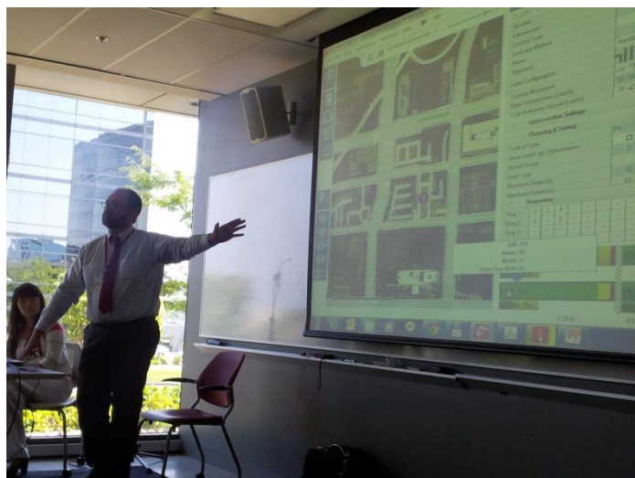
Photo: PTV, Sidra and TRL conducting presentations.

ITE Toronto Section held their 4 th Toronto SimCap (Simulation & Capacity Analysis) User Group meeting on July 22, 2014 at the MMM Group’s Markham office.