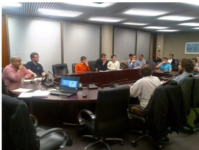
Photo: Participants at ITE Toronto's SimCAP User Group, April 2014, Toronto

This free workshop discussed issues related to the Highway Capacity Manual 2010 (HCM 2010) and Synchro's ICU results. We had a great roundtable open discussion on a sample problem provided by one of our members. We also discussed Synchro 8 constraints, the use of different analysis techniques with the current capacity software, and, the potential for use of other software packages in the future. Thank you very much to those attended and provided lots of great feedback and comment for future consideration.