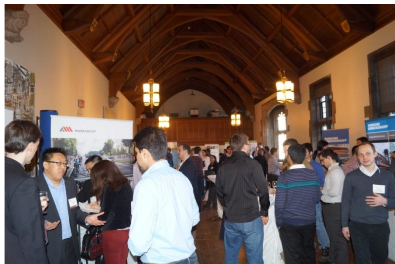
Photo: Participants at 2014 University of Toronto ITE Student-Industry Mixer

Attended by more than 100 students, University of Toronto Institute of Transportation Engineers (UT-ITE) Student Chapter hosted its third "Student-Industry Mixer", in coordination with the ITE Toronto Section.