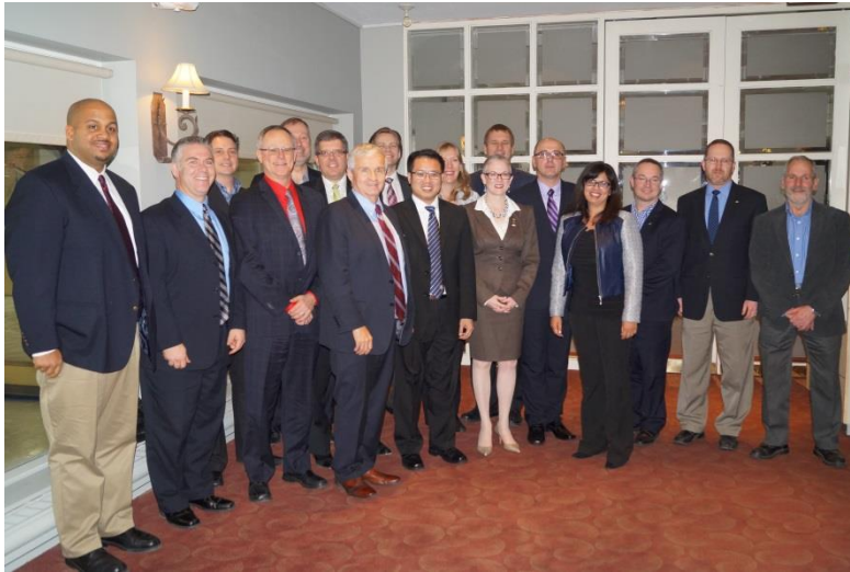
Photo: ITE Toronto Section Presidents

University of Toronto's ITE Student Chapter was recognized at the luncheon for their outstanding performance in the 2014 ITE Traffic Bowl competition. They fought their way to the top as the Canadian District Champions which qualified them for the 2014 Grand Championship competition held at the ITE International Meeting and Exhibit in Seattle, Washington, USA. Great job!