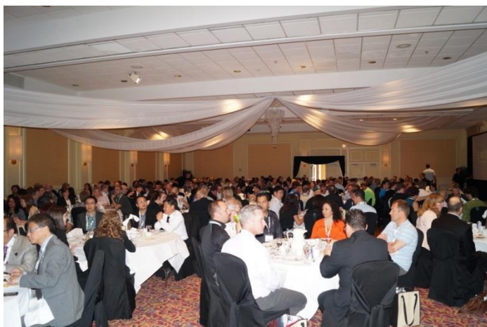
Photo: 2014 CITE/OTEC Lunch and Awards

Close to 300 delegates attended this year's Joint CITE/OTC Conference in Waterloo Region. A special thanks to the ITE Southwestern Ontario Section and the Local Arrangements Committee (LAC) for putting on a great conference.