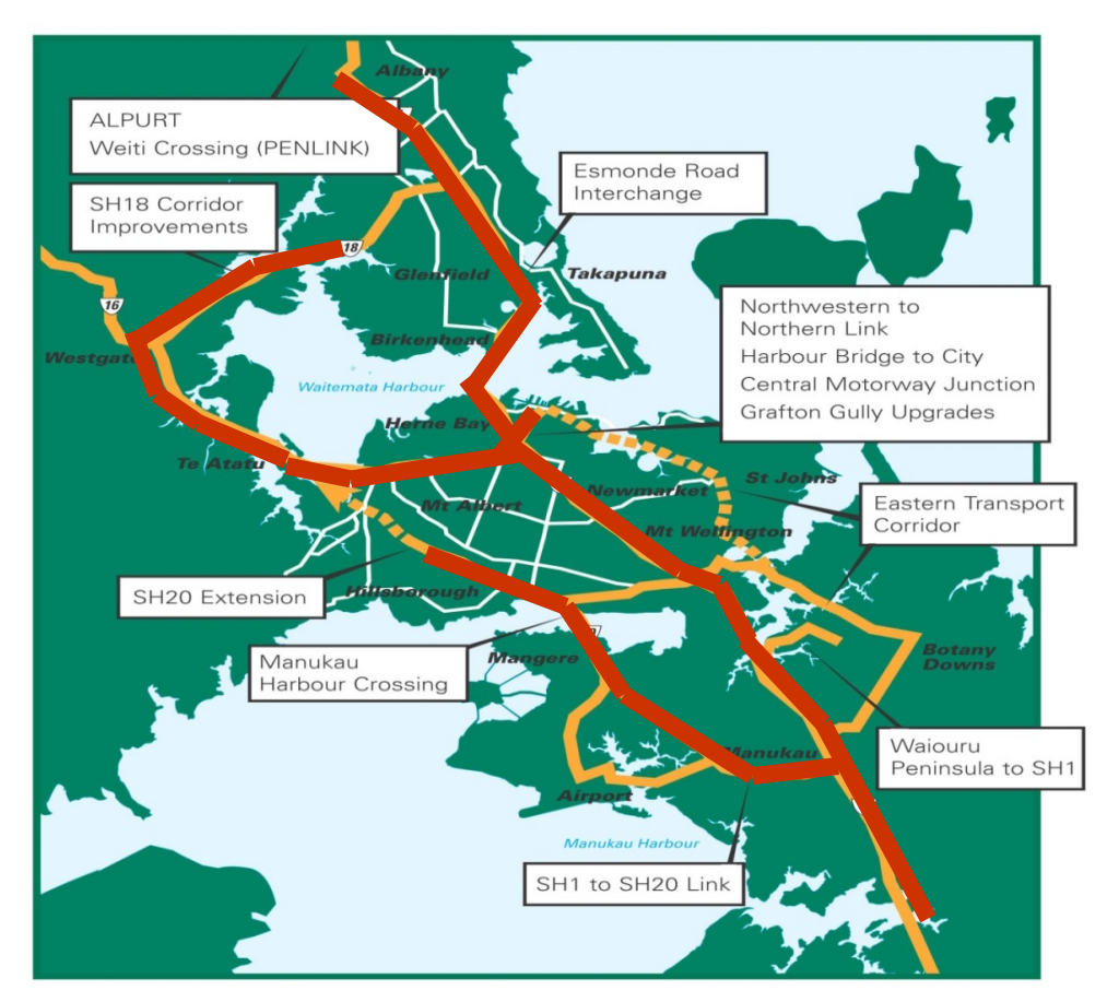
Figure 1 - Map of Auckland Motorway Network

The Northern Motorway extends from the CBD across Waitemata Harbour to Albany and beyond. The Southern Motorway extends from the CBD through Manukau to the south, the Northwestern Motorway from the CBD to the west to Westgate, and the Southwestern Motorway from Manukau to north of Hillsborough. Auckland's biggest transport project is currently underway to link the Southwestern Motorway to the Northwestern Motorway via the "Waterview Tunnel" project.