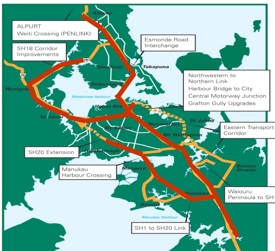
Figure 1 - Map of Auckland Motorway Network

The Northern Motorway extends from the CBD across Waitemata Harbour to Albany and beyond. The Southern Motorway extends from the CBD through Manukau to the south, the Northwestern Motorway from the CBD to the west to Westgate, and the Southwestern Motorway from Manukau to north of Hillsborough. Auckland's biggest transport project is currently underway to link the Southwestern Motorway to the Northwestern Motorway via the "Waterview Tunnel" project.