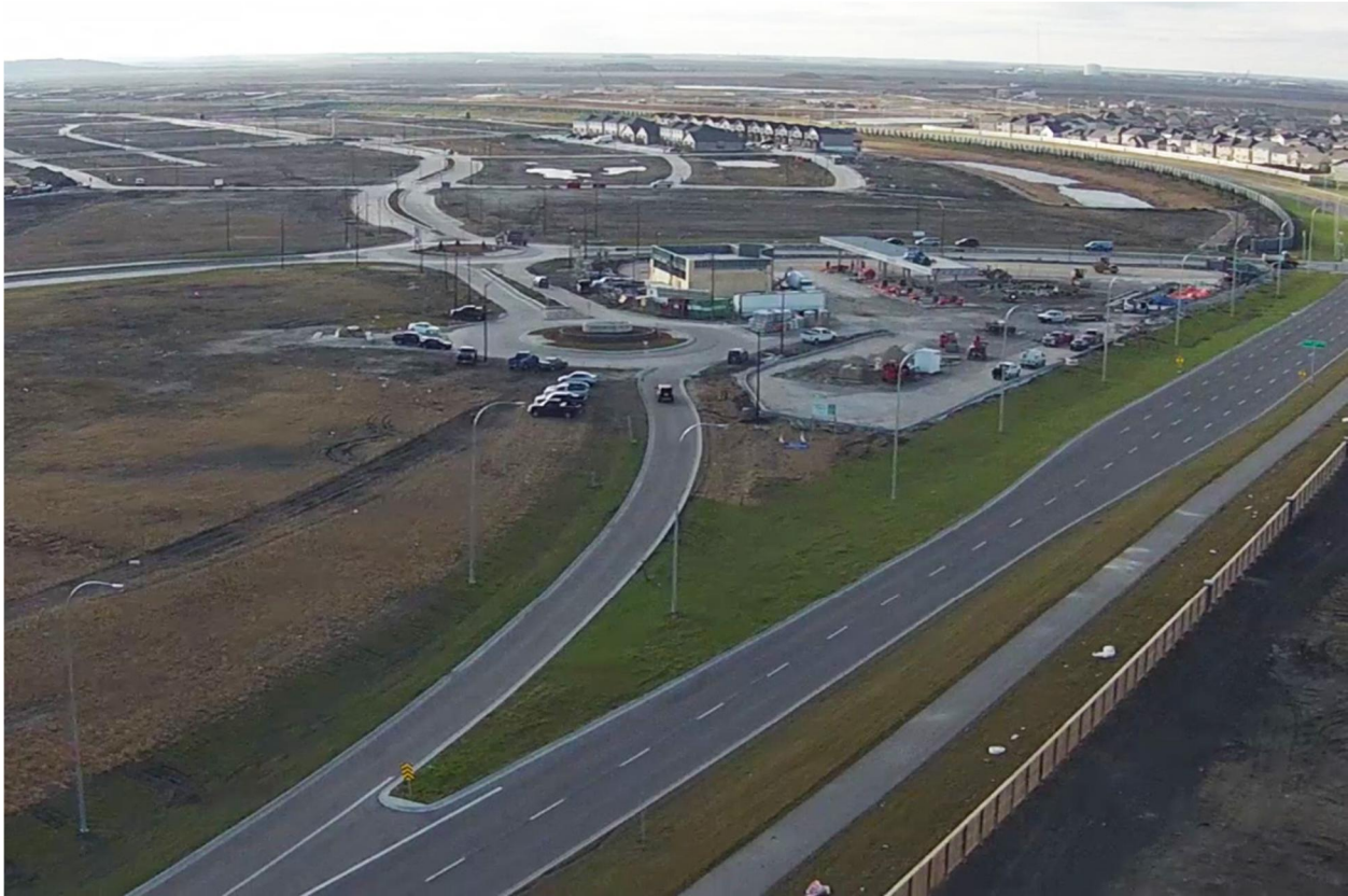
Figure 2: Kenaston SB Lanes in Foreground, with Off-ramp to Roundabouts and Internal Roadways in the “Bridgwater Town Centre”

Contract 1 had unique geometric design challenges. All design had to accommodate a future six lane facility, so intersection crossfalls had to be carefully designed to be “future proof”. The curvilinear alignment of Kenaston also presented challenges with back to back superelevation, noise berm height requirements, and intersection sight distance. For the latter, a study was undertaken to determine if there were any issues with sight distance at the six intersections (plus Waverley Street). Consideration had to be made to visibility if signals were in flash mode or out of commission. Alterations to berm locations and landscaping plantings were suggested to improve safety. The Bridgwater Centre, to which Contract 1 surrounds, is designed to be a dense, walkable community. Therefore, the character of Kenaston must change when in this area. An urban cross-section was selected to best mesh with the Centre. The roadway maintains a consistent, 90 km/hr design speed, but the right-of-way and thus corridor is more compact, sans shoulders or ditches, and is faster to cross for pedestrians and cyclists. Outside of Bridgwater Centre, the roadway was designed to transition to a more cost effective, open rural cross-section, where less interaction with other travel modes occur.