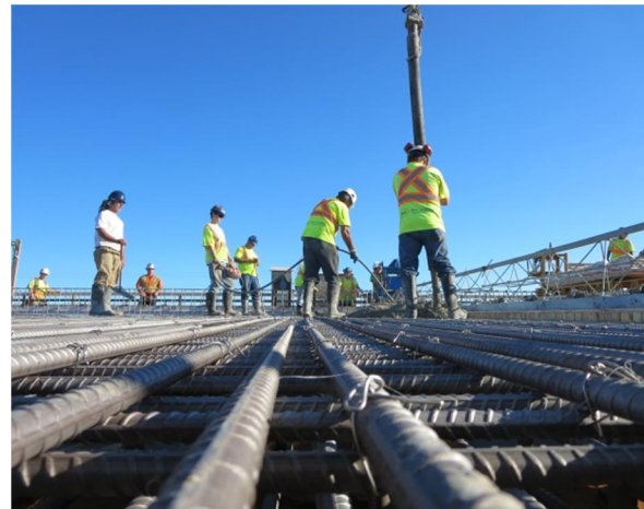
Figure 4: Concrete Deck Construction

The limited right-of-way in the overpass area resulted in design challenges for the final road profile. Immediately to the south of the overpass is a Manitoba Hydro corridor, of which the ground elevation could not be altered. To the north are the existing lanes of Bishop Grandin. This resulted in a tight horizontal radius. With bridge barriers in place, the design team realized that stopping sight distance was not achievable. As an example of the ingenuity of the team, the geometry was reworked with a higher superelevation to further reduce the radii, and the inner road shoulder was widened to 3.5 m, effectively allowing drivers to see “across the curve”. This was key to working within the site limitations.