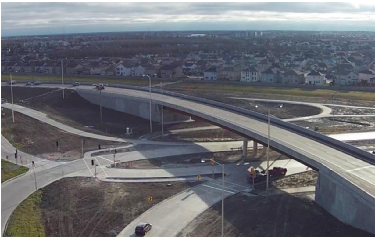
Figure 3: Completed Kenaston Overpass

Kenaston Overpass is the first grade-separated structure, not involving a water or railway, constructed in Winnipeg in over 20 years. Built under Contract 2, the Kenaston Overpass consists of a two-lane bridge structure and ramp lanes that connect southbound Kenaston to eastbound Bishop Grandin. With the realignment of the through-lane over the bridge, modifications and improvements at the Kenaston and Bishop Grandin at-grade intersection were also completed.