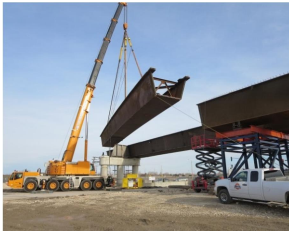
Figure 5: Girder Erection

drilled onsite to facilitate a continuous wet cure system for the deck. The placement and curing regime was monitored closely and together they mitigated potential thermal and drying shrinkage during plastic and hardened states.