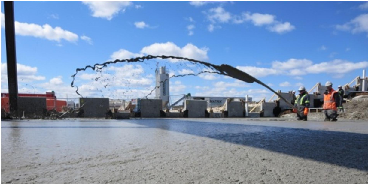
Figure 7: Pumping of Lightweight Concrete Fill

Lightweight concrete was pumped from the plant, located in the west laydown area, through a hose to the embankment being backfilled. The hose could not run across the active roadway, so deck overhang construction was expedited and the hose was run up and over the bridge to reach the east embankment. Special hose sections and connections were required for the bends in order to maintain proper pumping. The system was successfully used and monitored daily with no issues.