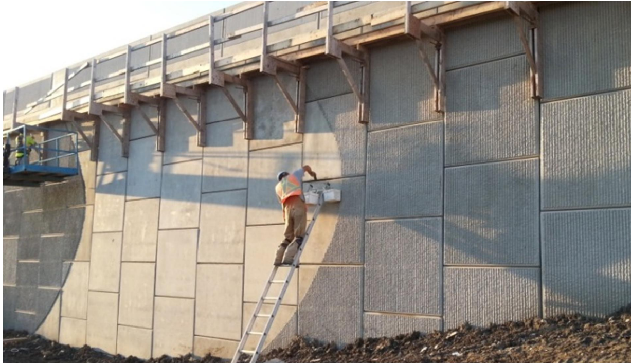
Figure 6: MSE Wall Construction with “Aurora Borealis” Aesthetic Surface Treatment

thicknesses to equalize the foundation pressure. The lightweight concrete backfill is lighter than water, due to its high air content, but with performance characteristics comparable to that of the surrounding clay. The approach embankments were constructed earlier in the WWARP III project and partially acted as preloading for early high settlement periods. The embankments also were stepped together with the backfill to accommodate uniform foundation loading.