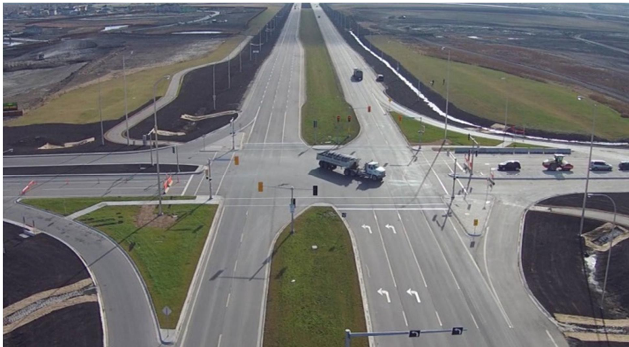
Figure 8: Smart Channels going from Major to Minor Roadway

Another feature used notably at the Waverley Street (Waverley) intersection is a “smart channel”. Typically, right turn channels, or right turn cut-offs are seen at major intersections. They allow right turning traffic to avoid the signalized intersection and make a yield movement. They also provide pedestrian refuge and a reduced crossing distance. Smart channels are an improvement in that the angle for the yielding driver allows them to “look left” with less strain, but slows them further than a typical channel due to the acute geometry. This is safer for pedestrians and prepares the driver to exit the high speed facility (Kenaston) and enter the lower speed facility (Waverley). Figure 8 shows the smart channels in the bottom right and top left corners going from the major to minor roadway.