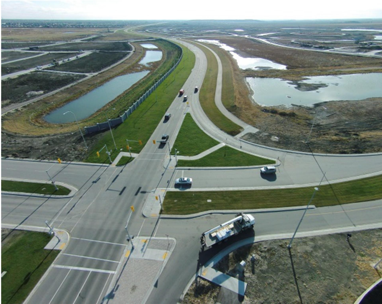
Figure 9: Active Transportation Paths Constructed along SB Kenaston

The intersection of Kenaston and Bishop Grandin with the overpass is a unique one, and it presented a challenge to include the multi-use paths. Pedestrian desire lines are satisfied in the ample radii and multiple alignments, and the open concept of the underpass is used to its advantage to provide good sightlines to the vehicle intersection. This project has the distinction of completing the over 11 km long Bishop Grandin Greenway, allowing active users to travel from southeast to southwest Winnipeg on their own separated facility. CPTED principles (Crime Prevention Through Environmental Design) were used during design. For example, the pathway was kept closer to the roadway for improved lighting and visibility.