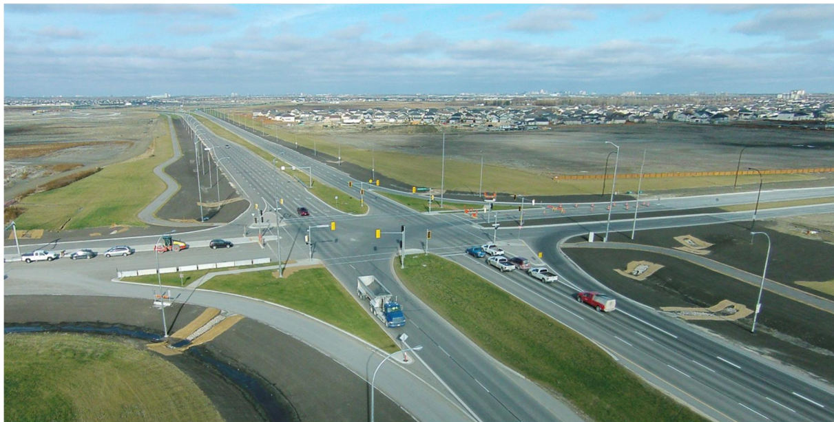
Figure 10: Kenaston at Waverley

Due to the linkage it provides between major industrial/commercial sites and national/international trade routes, the Kenaston extension handles a large volume of truck traffic, which has resulted in significant cost savings for the transport industry. Furthermore, WWARP III highlights the transportation field’s promotion of sustainable and economic viability through innovative infrastructure design and walkable and multi-use infrastructure integration into the Waverley West neighbourhood. The project provides real world examples of challenges faced when translating standards and guidelines on paper, onto pavement in the field. The safety of road users was of utmost importance and good geometric design was key to building a facility that protects users, yet at the same time allows for efficient movement.