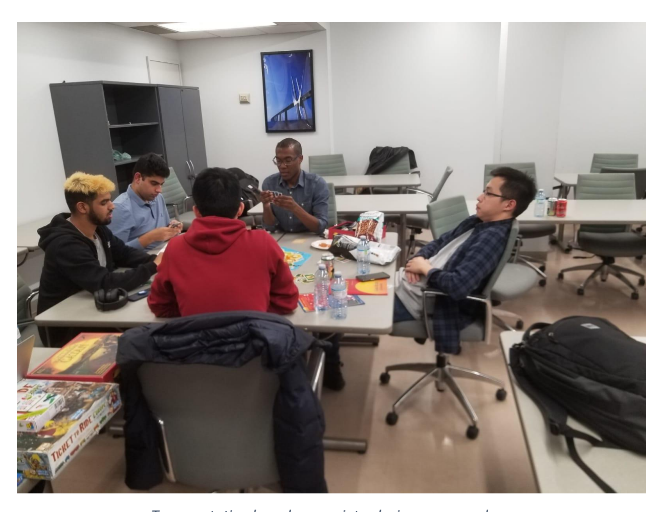
Transportation board games introducing new members

On November 22<sup>nd</sup>, 2018, RITE hosted an event to introduce students to the Transportation world in a fun way while providing a relaxing environment as students prepared for their final exams. The event included Transportation-themed board games as well as snacks and drinks.