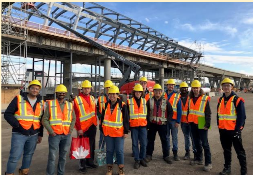
ITEUA members at the technical tour

The full schedule arranged with TransEd would make 4 separate stops along the alignment, highlighting major landmarks such as the Tawatinâ Bridge over the North Saskatchewan River and the elevated Davies Station, shown in the included picture. The other major organizing challenge was determining number of attendees. Initially receiving interest from 19 (plus executive), determining the timeslot for a variety of student demographics was difficult. In the end, we received 10 participants, plus 2 executives. This event was an amazing opportunity for students to directly observe the details and complexity of LRT construction projects.