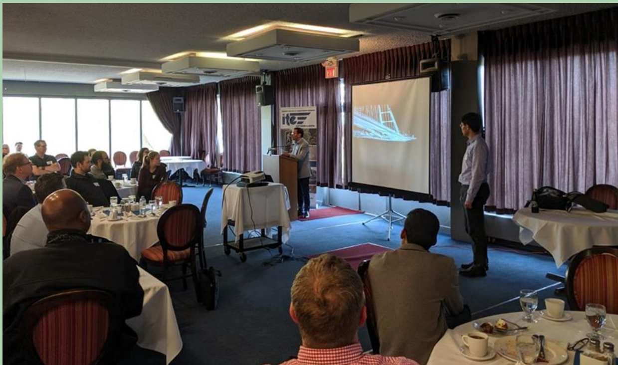
NACITE Luncheon at University of Alberta