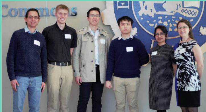
Mixer organizing team

Annual Student-Industry Mixer is the flagship event hosted by ITEUA. The Mixer offers a platform for direct interaction between the industry representatives and students. Students from any discipline at any point in their educational careers are able to mingle with professionals from the transportation industry in a relaxed setting. This helps students connect with professionals from the industry while also assisting them in developing their interpersonal skills.