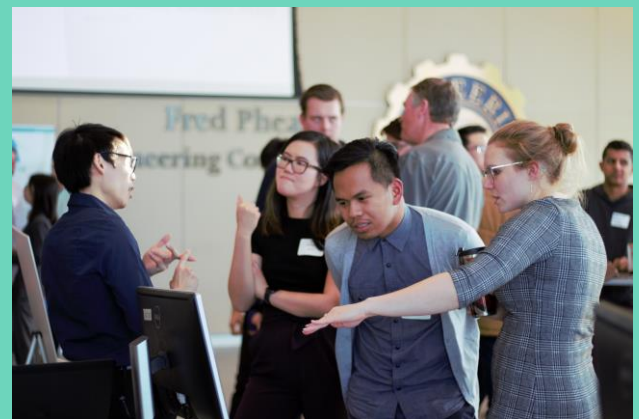
Students and professionals are busy networking at the Mixer

We received an overwhelmingly positive response from the industries and a record number of fourteen organizations signed up for the 2019 Mixer. The event was a great success and heavily attended by both students and industry. Over 40 professionals representing the participating companies attended the Mixer and interacted with over 70 students including 3rd, 4th and 5th year undergraduates as well as PhD and MSc students. Transportation Engineering professors of the University of Alberta, Engineers-in-Training and Professional Engineers from non-sponsoring companies were also present during the event.