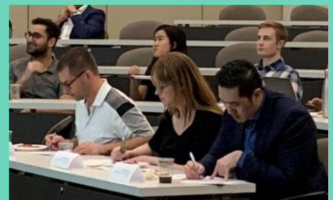
Honorable judges of the competition

Seven students from both undergraduate and graduate levels discussed their research and ideas regarding the impact of climate change on Canada's roads, winter road maintenance, LiDAR data, autonomous vehicles, traffic safety, Piezoelectric harvesters and collaborative transportation.