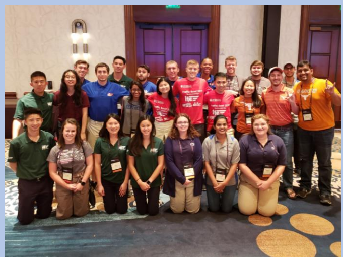
Top left: ITEUA Traffic Bowl team representing Canada; top right: ITE session; bottom left: round table discussion; bottom right: Traffic Bowl teams of participating student chapters