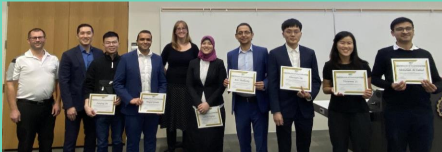
Competition participants with the judges

ITEUA organized its second Student Presentation Competition on January 31, 2020 at the University of Alberta’s Donadeo Innovation Center for Engineering. The competition provides the students, both graduate and undergraduate level, a platform to improve their presentation and public speaking skills while showcasing their research and ideas on different sectors of transportation. This year, we had separate categories for undergraduate and graduate students to ensure a level playing field. ITEUA and NACITE jointly awarded the winners a total of $700 in prizes.