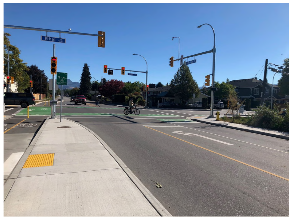
Figure 2: Recent cycle track project in Kelowna, BC (Sutherland Avenue and Ethel Street)