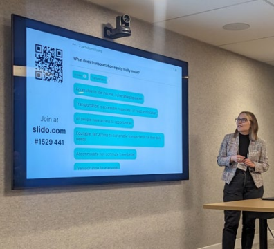
Figure 1: Images from How Can Transportation Engineers & Planners Move Equity from Rhetoric to Reality