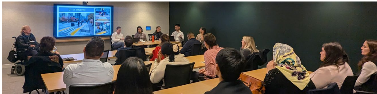
Figure 2: Presenters and Participants at the Island Platform Bus Stops: Beyond the Design Guide Discussion

With the recent passing of provincial accessibility legislation (The Accessible BC Act), and the 2020 BC Human Rights Tribunal ruling on Bus Stop Accessibility, professionals are looking for information on how to balance the need to quickly expand active transportation facilities without compromising safety for any members of the community, especially those who rely on transit for mobility.