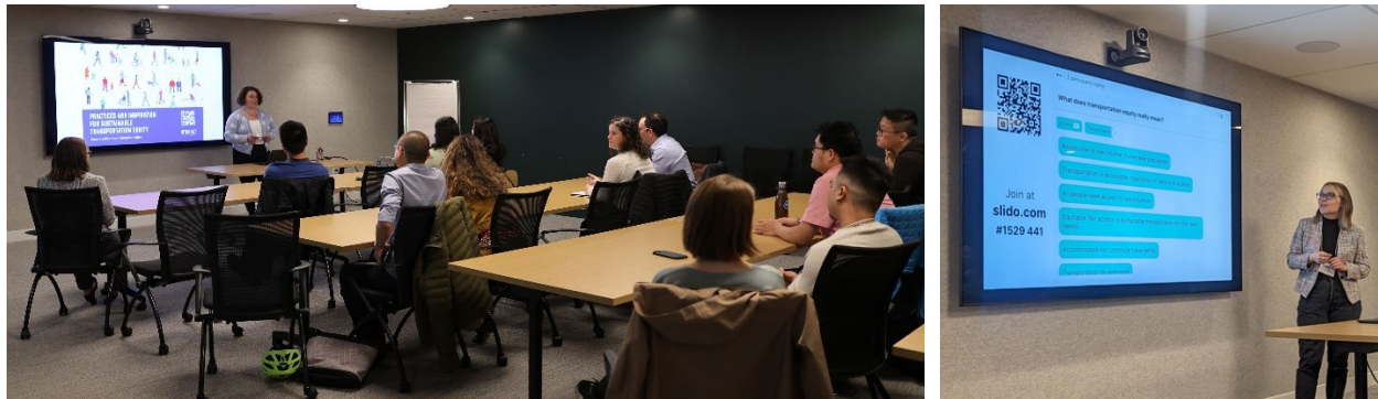
Figure 1: Images from How Can Transportation Engineers & Planners Move Equity from Rhetoric to Reality

ITE Greater Vancouver continued its partnership with the Planning Institute of BC to present a session on equity in transportation. While equity continues to receive substantial industry focus, practitioners have made it clear that practical guidance and examples are needed to achieve equity principles into day-to-day practice. Furthermore, this strategic partnership directly supports ITE International's push to broaden the organization as A Community of Transportation Professionals , with a special focus on the Planning profession. After the technical session a mixer was hosted to allow networking and harbour closer relationships between all of Greater Vancouver's transportation professionals.